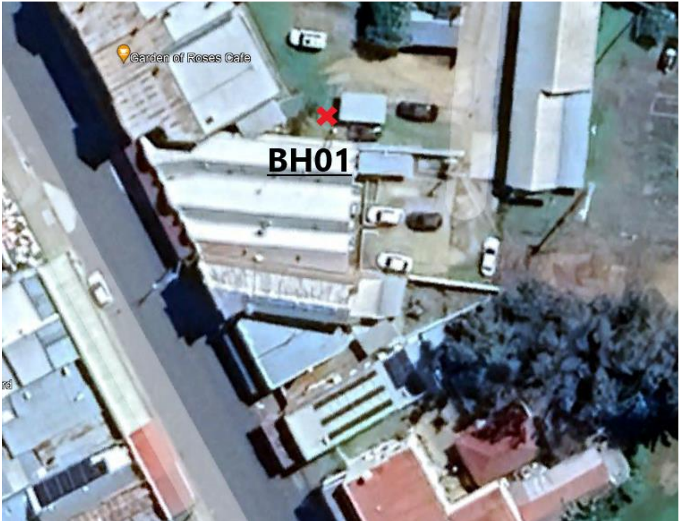
Overhead view of the site showing ASCT approximate test locations.