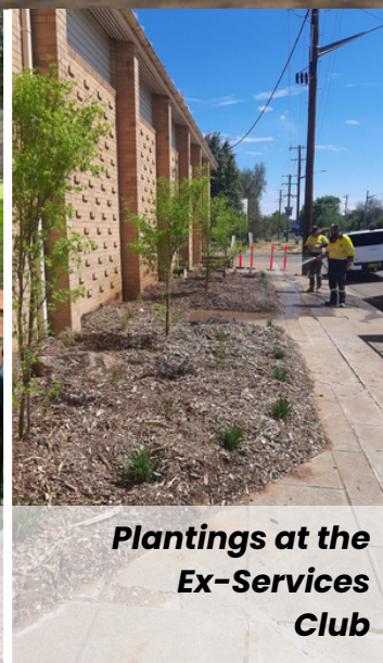
Plantings at the Ex-Services Club