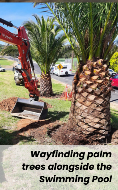
Wayfinding palm trees alongside the Swimming Pool