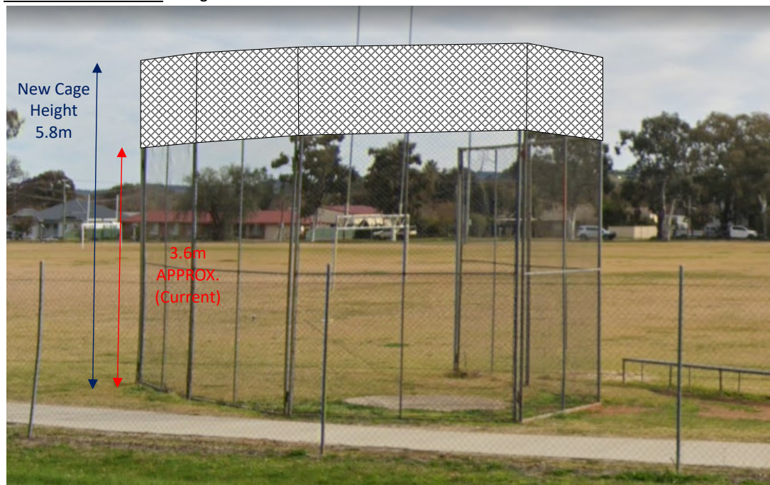
HAMMER THROW CAGE – Height Dimensions