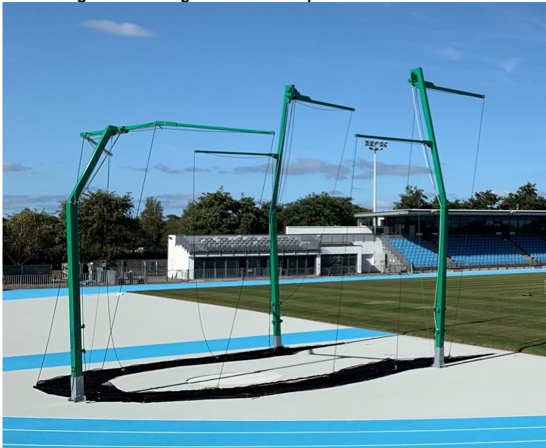
Thor 9 cage with netting in the raised position.