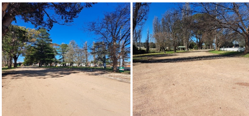
Heavy Patching at Molong Rec Ground Entrance