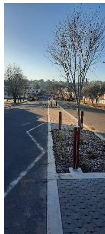
Molong Main Street Project – Stage 1 and 2