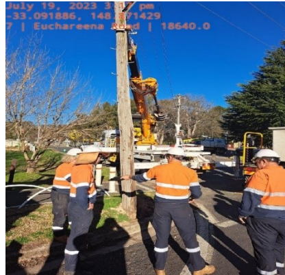
Essential Energy Crews on site at power pole incident