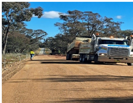
Belgravia Road – Getting ready for stabilization